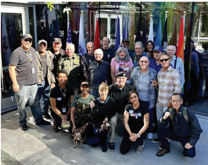
Veterans Day Breakfast

The Cyber Center is open for computer use on Tuesdays and Thursdays from 10:00 AM to 1:00 PM and 2:00 PM to 5:00 PM, based on availability. Location: The Village, 1125 N. McCadden Pl., Los Angeles, CA 90038.