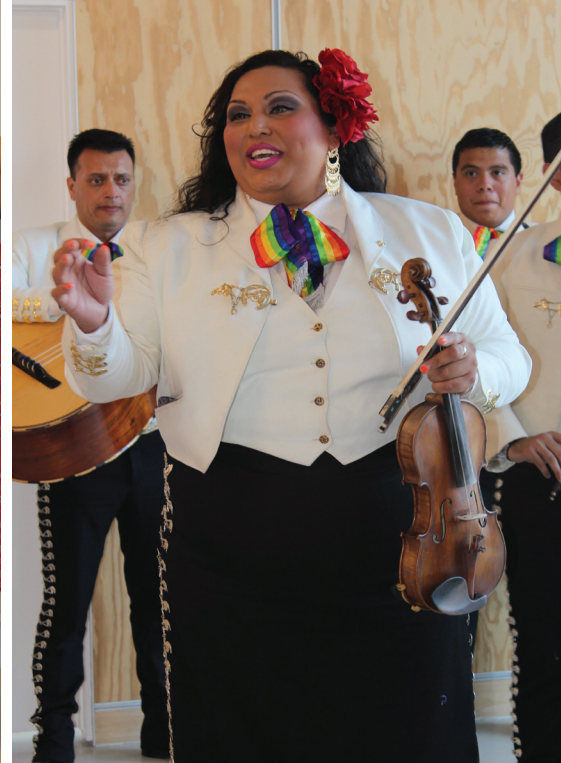
Celebrating the opening of Mi Centro with the world's first LGBT mariachi band.