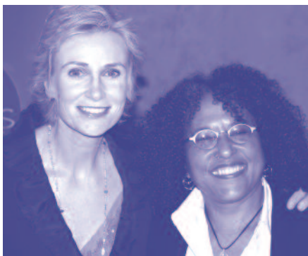
Lorri L. Jean